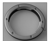
The EOS-LEL adapter.