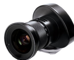
The new Voigtlander 15-35mm variable viewfinder. See our website for details.